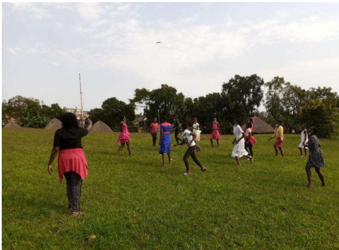
Fun time. After the material pretesting exercise, participants play with some of the products