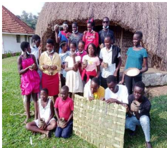
Participants pause for group photo with products after pre-testing