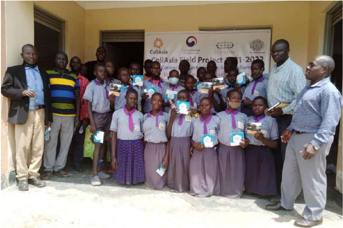
Group photograph at the closing ceremony of the Collasia Uganda Museum Outreach Project at Barlonyo