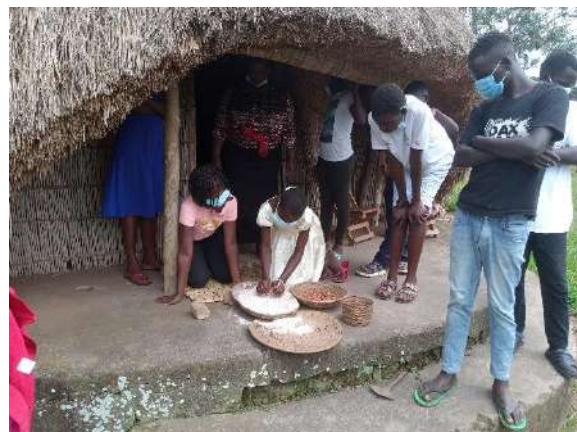
Meal Preparation: Pupils try out millet grinding

The basis of the CollAsia - Uganda Museum outreach project was to educate and encourage the young generation to appreciate their intangible skills and knowledge of traditional crafts and objects. The project implementation area was Barlonyo memorial site in Lira District in Northern Uganda. Before moving to Barlonyo, a pre-test of some of the craft materials was done on a similar population structure of fifteen young school-