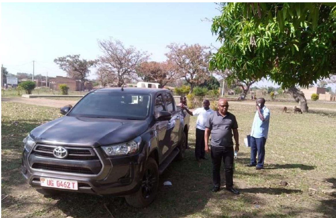
Ministry of Tourism Wildlife and Antiquities vehicle used for transport by the project staff on arrival at Barlonyo

The Ministry of Tourism Wildlife and Antiquities supported the implementation through the provision of vehicles to transport the project staff to Barlonyo and back and at times when movement was required. The project provided funds for fuel.