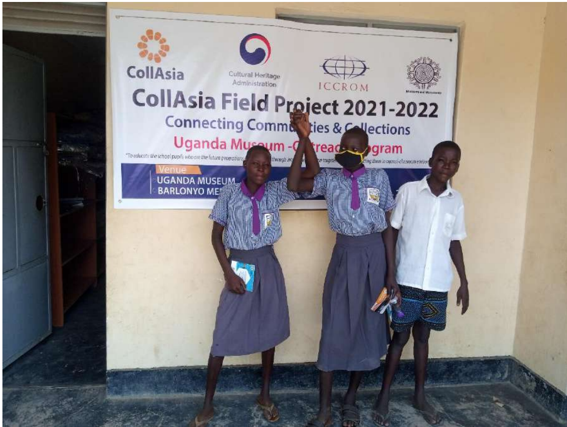
An inspiration to the pupils awakening their interest to visit museums and site