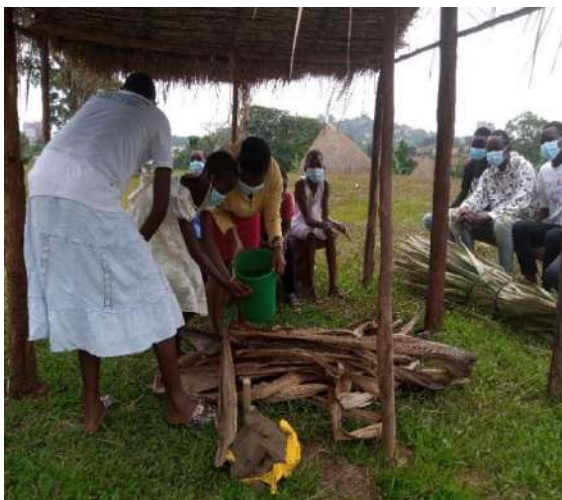
Participants prepare some banana fibres for the pre-testing exercise