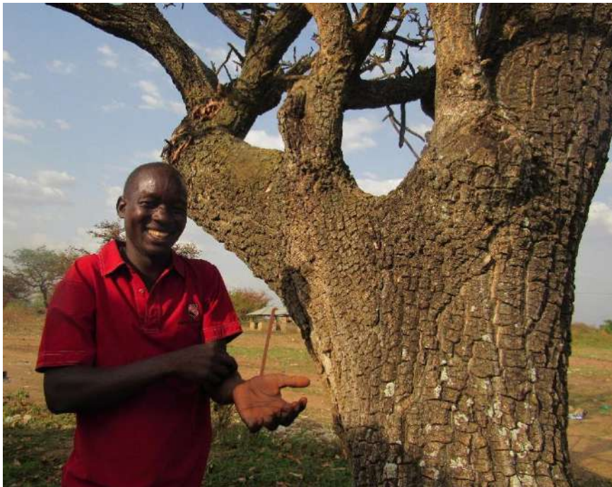
The sheer butter tree from where the name Barlonyo originated. The tree itself connects memories of the place of peace and wealth