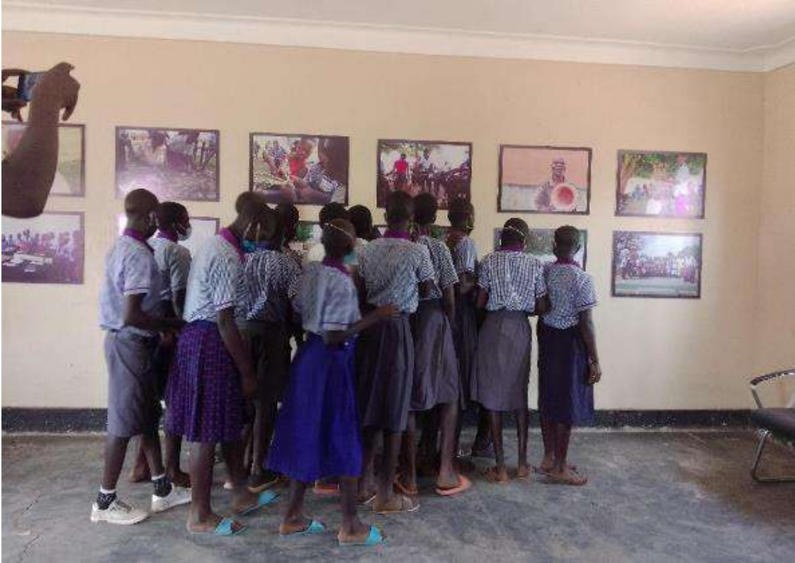
Pupils given a guided tour of the photo exhibition at Barlonyo