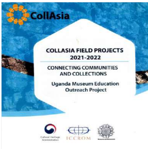
CollAsia Uganda Field Project 2021 – 2022 brochure (front cover)