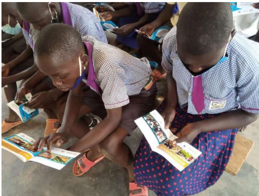
Pupils reading the CollAsia Field Project 2021 – 2022 brochure