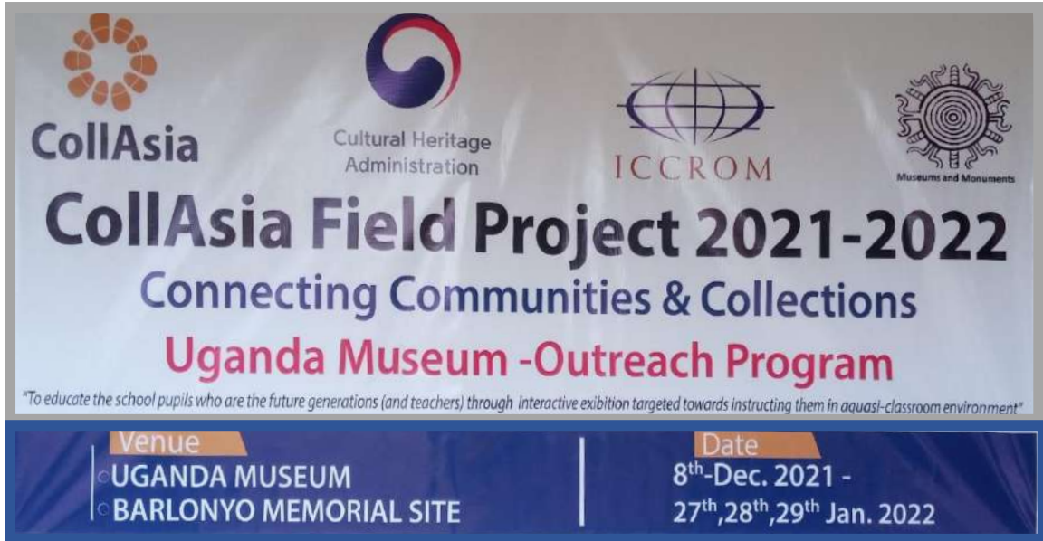
CollAsia Field Project 2021 – 2022 Banner