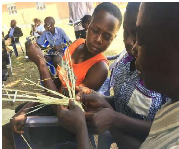
Pupils in a hands-on weaving process in the making of local mats and hats

While the focus was on transferring the skills from the traditional custodians to the young people, it was also a manifestation of an intangible product. The project also offered a platform for the young people to understand the raw materials from which the artefacts are made, the natural sources of the raw material, sustainability and interact with the bearers of the craftsmanship and contribute to knowledge hence co creation. Hand craft objects, made during the outreach were a manifestation of the craft skills learnt by the pupils during the outreach.