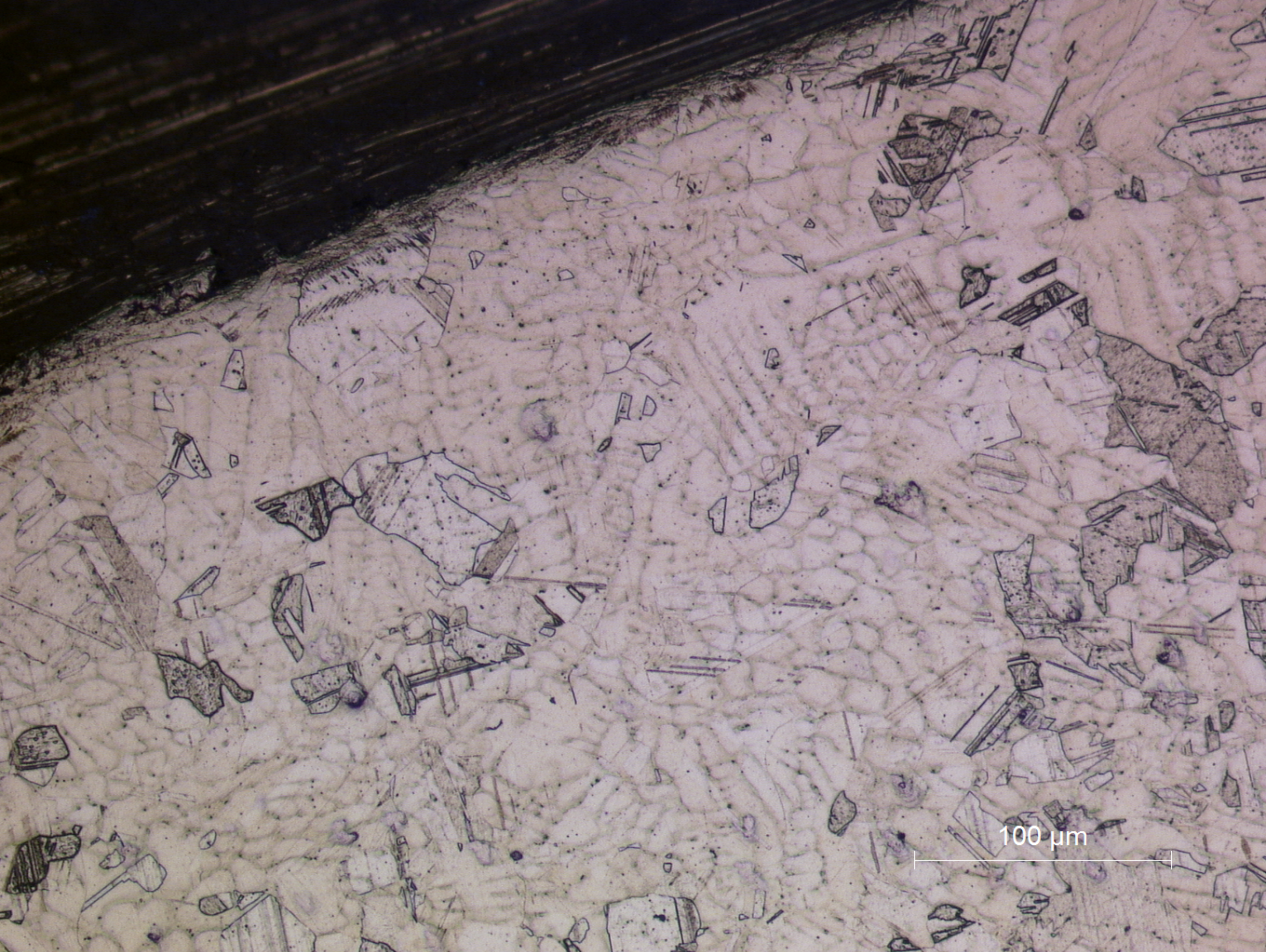
A90.1 The dendritic structure is partially recrystallized, due to some cold-work and annealing after casting (etchant: aqueous \text{FeCl}_3 ).