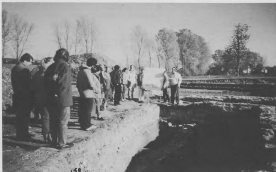
Participants in the Ghent conference take time off for a visit to Ename.

As a demonstration, a telephone "hookup" through Brussels between Rome and Toronto enabled access to a database combined from two others made to different standards: ICCROM's library index plus AATA (already published in book form) and Materials (unpublished, put together at CCI). The latter combination, a joint effort of