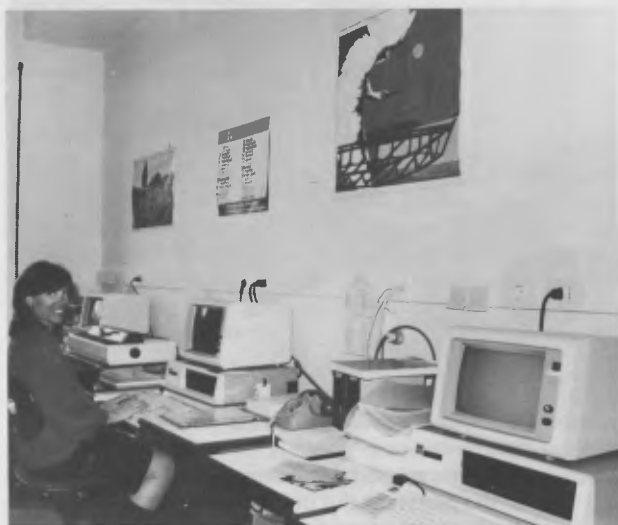
Several computer work stations have also been recently installed in the library.

It was possible to demonstrate, via a computer link Ottawa-Rome, the feasibility of a merged ICCROM-AATA data bank which could be widely distributed. The demonstration of the joint data base was offered by the GCI at the December meeting of directors of research laboratories (see Conference Reports).