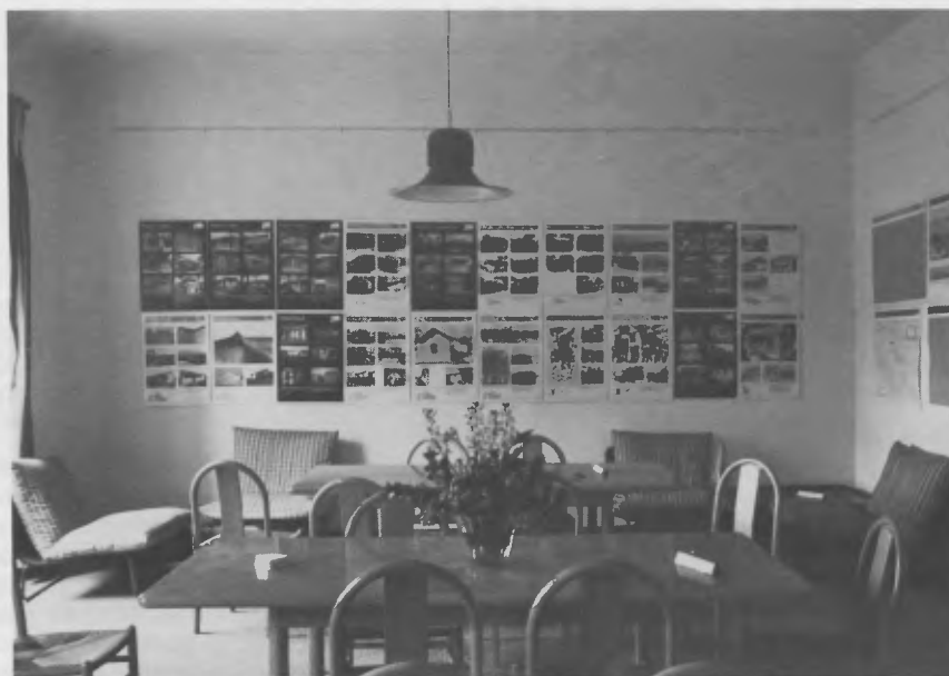
"Vernacula": Traditional Architecture in the Caribbean, on display in the ICCROM common room. This is a first regional exhibition which will be part of the events commemorating the fifth centennial of the discovery of America, 1492-1992. It has been sponsored by CARIMOS, OAS, and the University of Puerto Rico, Recinto de Rio Piedras.