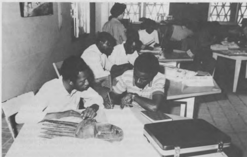
Bamako, Mali. Trainees team up to write inspection reports on various wooden museum objects.