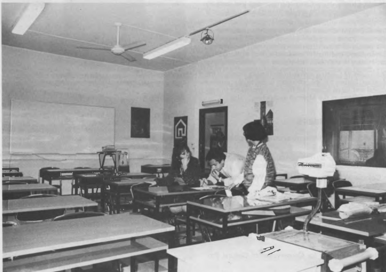
6 The renovated first floor premises have provided a comfortable lecture room for the SPC course and office space for visiting lecturers.