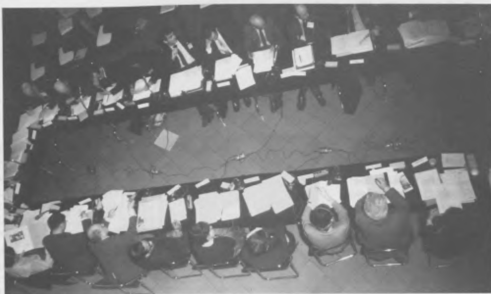
The GCI-ICCROM consultation brought laboratory directors together in Rome to discuss numerous items of common interest.

CCI and the Canadian Heritage Information Network, was sponsored by the Getty. The workings of the Network were shown in the course of searching for an acrylic usable as a consolidant and for an epoxy resin of specified viscosity. The demonstration occupied 61 minutes and used 124 "system resource units".