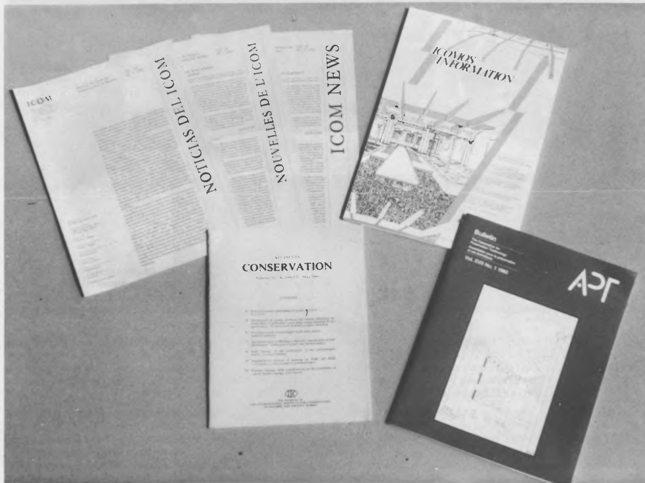
A sampling of the periodicals available to members of the organizations described above.