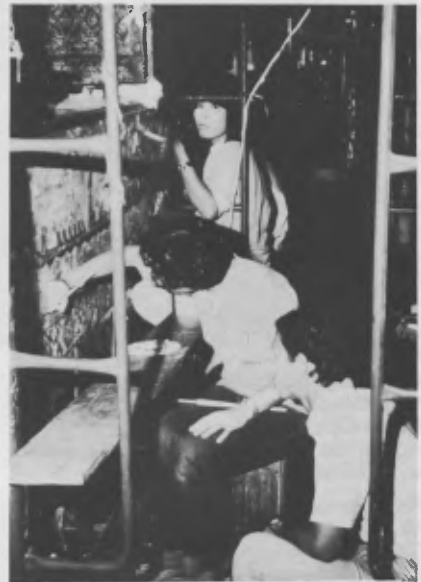
Bangkok. Demonstration of reintegration of a mural painting at Wat Pra Kaew, the Royal Palace.

Since 1979, ICCROM has been active in a project funded by the Ford Foundation to assist the Department of Fine Arts in increasing the professional competence of its staff and perfecting methods for conserving tempera mural paintings in a tropical climate. During this project, new techniques for reattaching and cleaning unstable tempera paintings were developed and were applied at Wat Sutat, Bangkok, during a three-year bilateral assistance programme between Thailand and the Federal Republic of Germany in which ICCROM provided technical assistance. This work concluded with the end of the five-year Ford Foundation budget. A report of the work was presented at the Ford Founda-