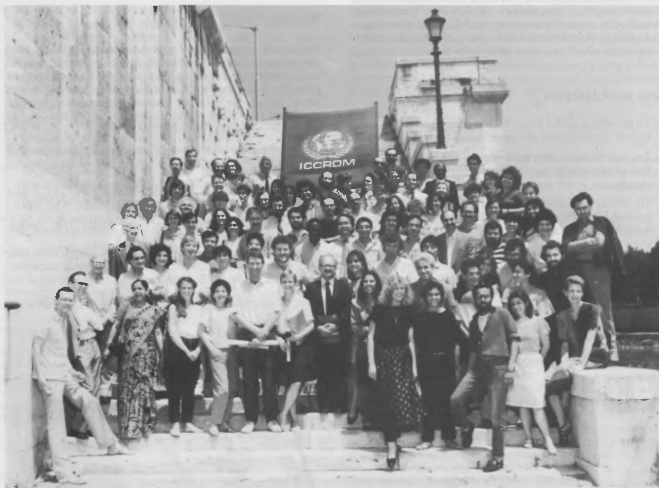
The traditional ICCROM group photo, 1985 model, after the awarding of certificates in June.