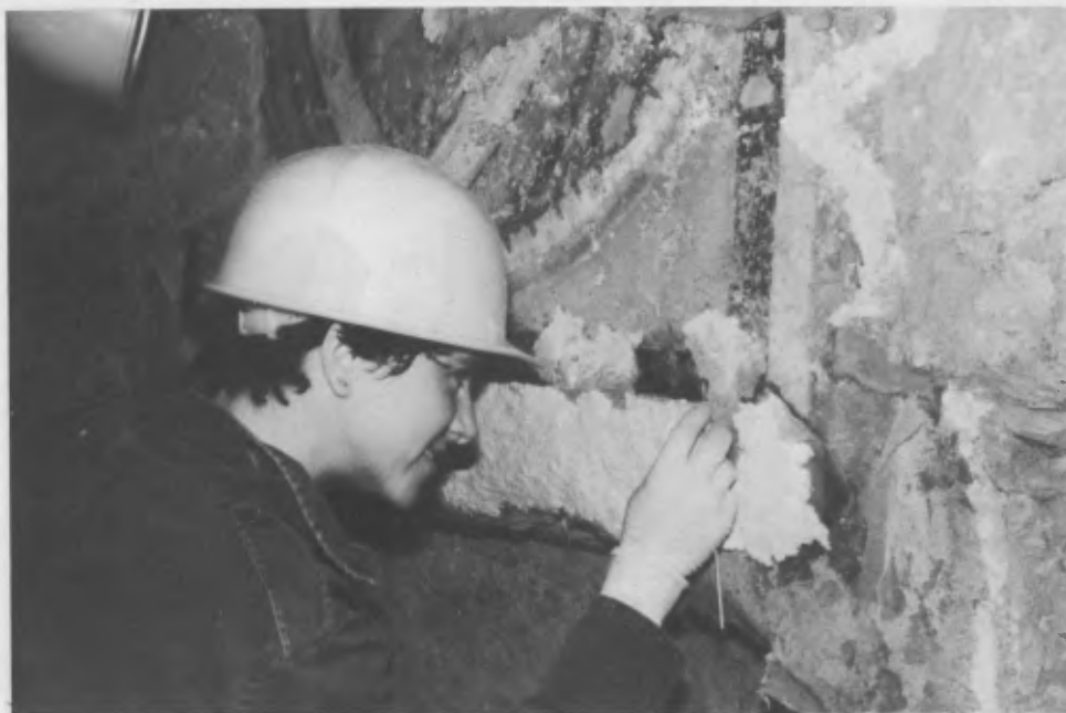
A MUR85 participant at work on one of the eighth-century paintings of Santa Maria Antiqua, in the Roman Forum.

In addition to visits to local laboratories, two study tours were organized, one to northern Italy and the other to Naples, Pompeii and Herculaneum. The programme also included visits to restoration labs in Florence, Bologna, Faenza, and Venice.