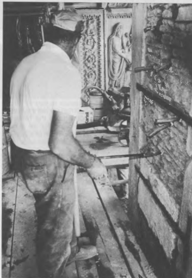
Rome: Arco degli Argentari. Holes were drilled up to 1.20 m deep into the sides of the weakened pier, seen here from the back. After the structure was dampened, a grouting mixture was injected from the bottom up.