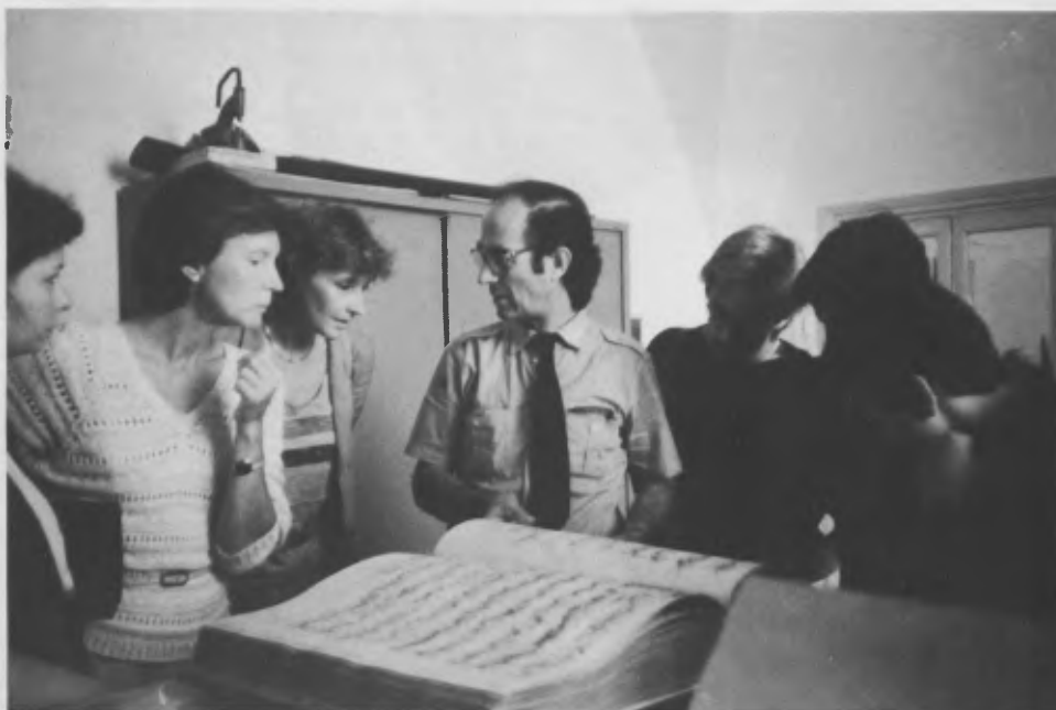
Participants in the new course on paper conservation are shown around the restoration laboratory of the Vatican Library.

This course will NOT be held in 1986, but will be given again in 1987, with more emphasis on archival materials. (P.M.S.)