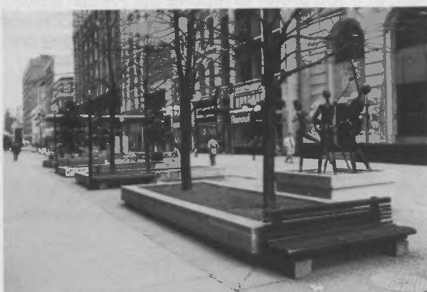
Sparks Street Mall, Ottawa, Canada. One of the first pedestrian malls in this country, created in 1967. Now the object of a design competition to try and find the vitality and success that has eluded the pedestrian mall in its 20-year life.

The draft Vernacular Charter as proposed in Bulgaria in October 1985, appears similarly "out of sync" with North American perceptions. Two major problems: first, a definition of vernacular (rural buildings or ensembles of the pre-industrial era) which would appear to exclude North America (and many other parts of the world), and, secondly, the prescription of suitable treatment for vernacular expression in terms and concepts normally used for monuments. Recognition of the value of encouraging continuity in vernacular expression – responding to the pre-eminent importance of process over product (the form of a structure at a moment in time) – is entirely absent in the Charter's conception. A North American approach to this particular problem may be summed up in a short declaration prepared for an ICOMOS Canada workshop held in Ottawa, in November 1985, developed to provide some guidance to ongoing review of the Vernacular Charter.