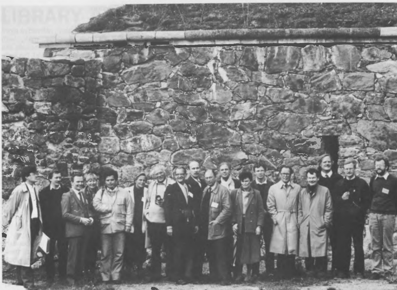
Helsinki. The international experts assembled at the Suomenlinna Seminar.