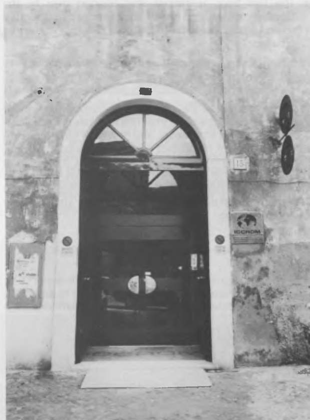
ICCROM's new glass entrance doors combine a more welcoming aspect with improved emergency exit features.