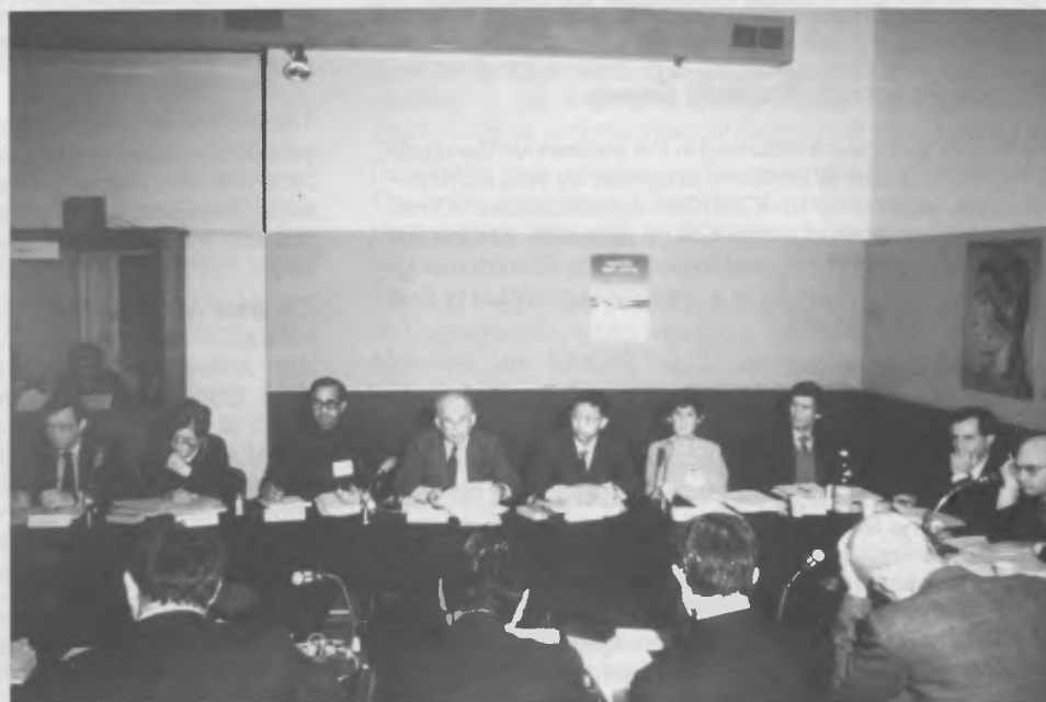
Another view of the GCI-ICCROM consultation group.