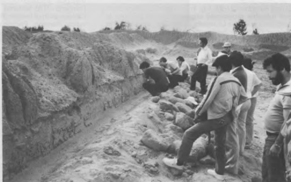
Chan Chan, Peru. A site inspection during the course on preservation of adobe.