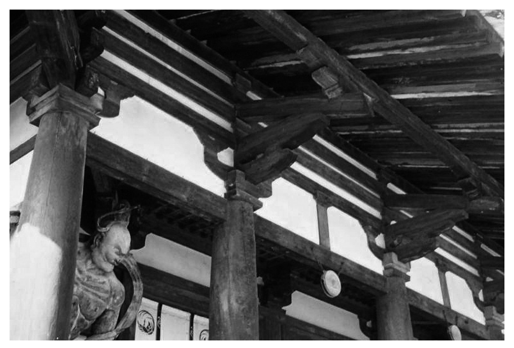
STRUCTURE OF A TEMPLE IN JAPAN. The craft of heritage are considered as intangible heritage.

routes such as the Qhapaq Ñan, the Andean road network or the Way of Saint James connect countries and bear witness to cultural and artistic exchanges over time. The message of these examples of the World Heritage List, "in all the richness of their authenticity," bears witness to "the unity of human values."