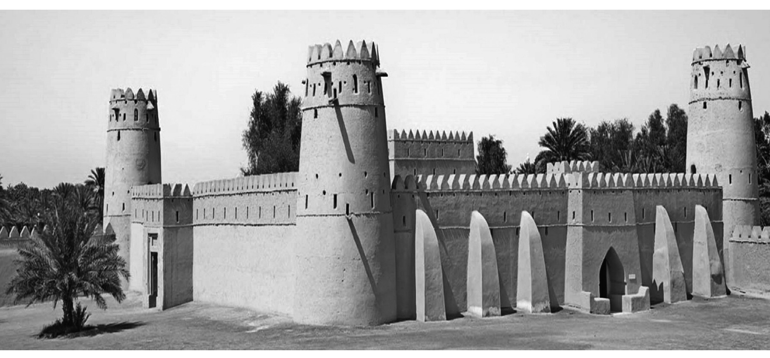
RECONSTRUCTION IN DUBAI, UNITED ARAB EMIRATES.

thus not possible to base judgments of values and authenticity within fixed criteria." It should also be noted that the Guidelines, which nevertheless reproduce almost word for word the text of the Nara document , have fortunately omitted this sentence in Article 81.