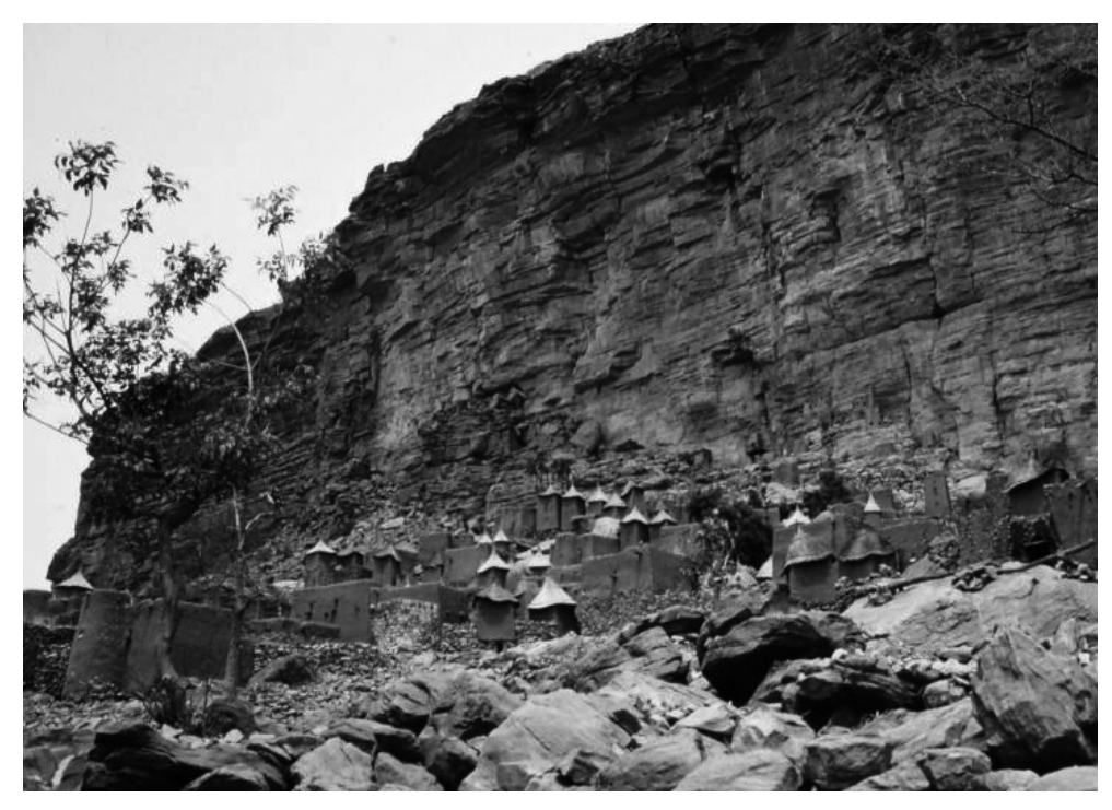
BIANDAGARA CLIFFS IN THE DOGON COUNTRY (MALI). The concept of authenticity must accept an evolution of the site that responds to the desire of the populations to have better living conditions.